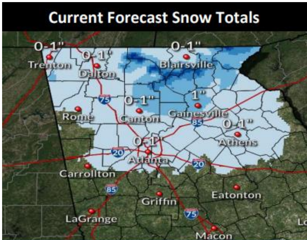
Figure 2: Current NWS Forecast Snow Totals