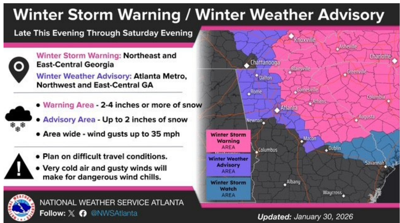
Figure 1: Winter Storm Warning/Winter Weather Advisory Areas (NWS Peachtree City)