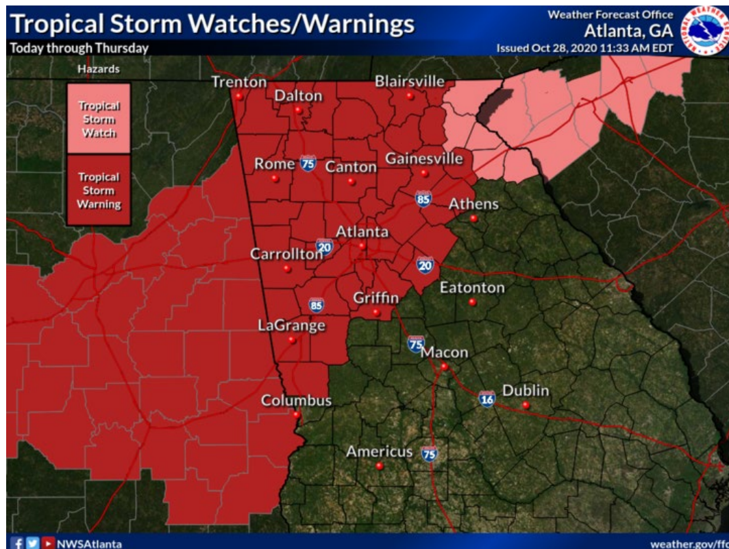
Figure 2: Tropical Storm Warning (NWS Atlanta)