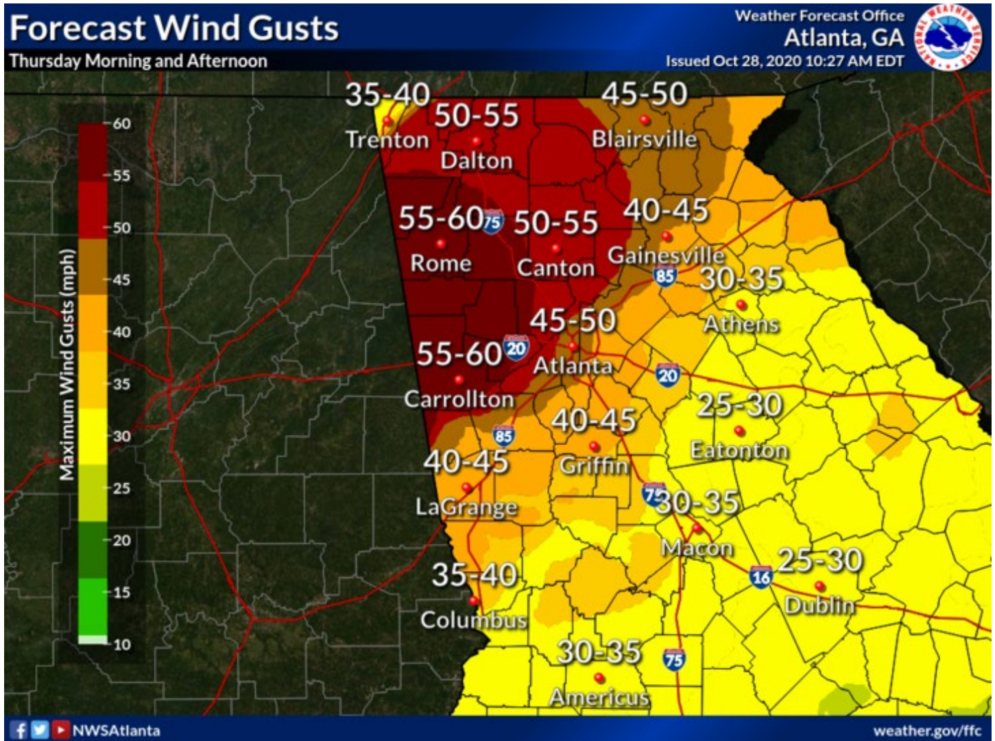
Figure 3: Forecast Wind Gusts (NWS Atlanta)